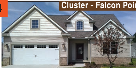
4 Cluster - Falcon Point