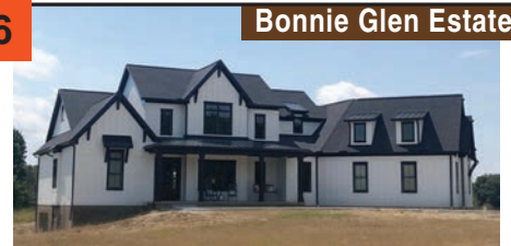
6 Bonnie Glen Estates