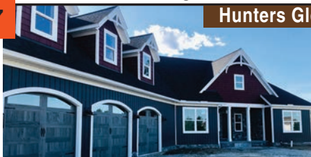
7 Hunters Glen