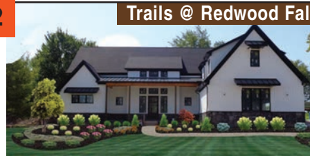
2 Trails @ Redwood Falls