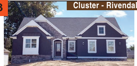
3 Cluster - Rivendale