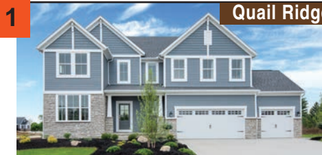
1 Quail Ridge

HOURS: Sat & Sun ONLY Noon to 5pm, Weekdays by Appointment