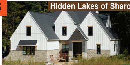
5 Hidden Lakes of Sharon