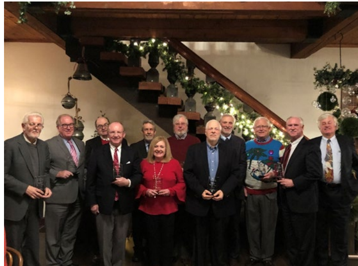
Right Photo: Those honored for 40 Years of Practice at the 2019 Holiday Party the Oaks Lakeside.